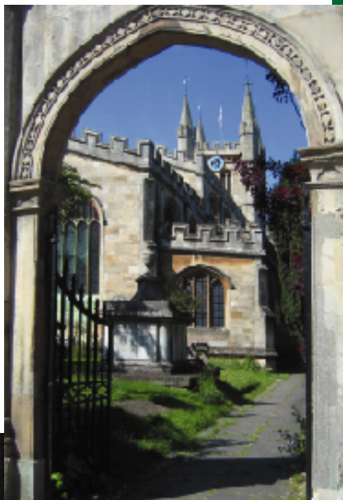
St Nicolas Church, Newbury