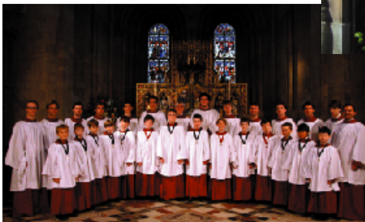
Christ Church Cathedral Choir