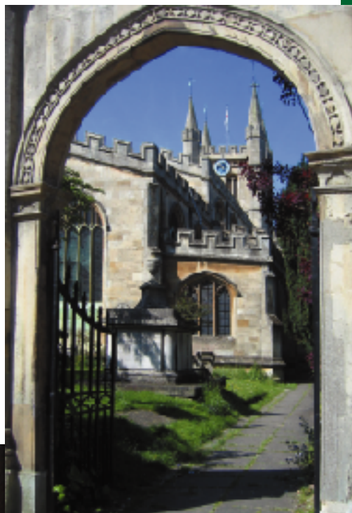
St Nicolas Church, Newbury