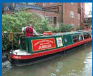
Photos above: Community Youth Project holiday activities at Bishops Green