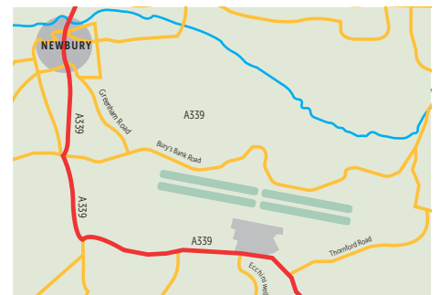
Road routes around Greenham Common

to Newbury by the new security gate, (rather than the entrance by the Jaguar Landrover showroom). The route will be signposted. Enter by the security gate onto Albury Way, go over first roundabout onto Communications Rd, take first left onto Jones Drive, then first right into Warehouse Road. Follow the road round to the left into Buckner Close and along to the end where you will see the Venture West building (the Decontamination Suite is at the far end of the Venture West building by the entrance to the Common). Weekend parking is available, for weekday parking and bus drop-offs please follow the signs. Buses can drop off at the Venture West building but please park on Plot 92 on the Business Park if you are waiting for groups.