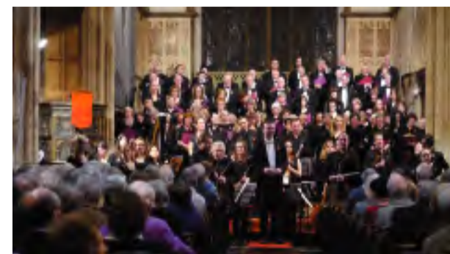
Photos: Newbury Choral Society concert