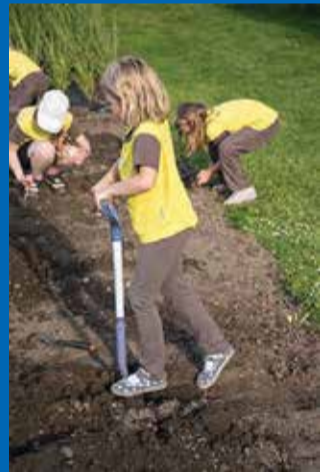
Photos above: Community Youth Project holiday activities at Bishops Green